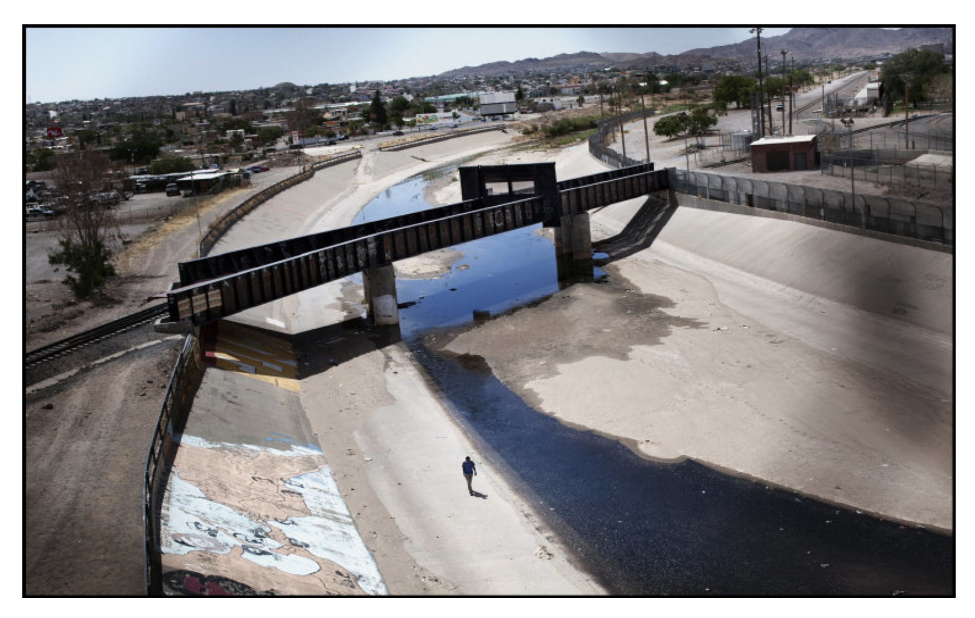
Photograph of shooting location (view from Paso del Norte bridge), Paolo Pellegrin, Magnum Photos, available at http://bit.ly/1IHkVPZ.